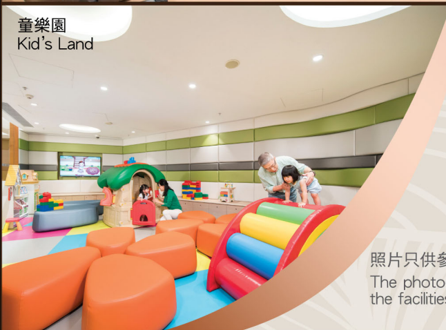
童樂園 Kid's Land