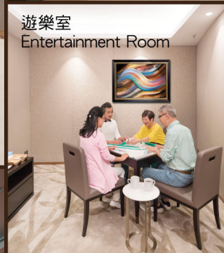
遊樂室 Entertainment Room