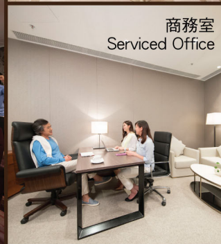
商務室 Serviced Office