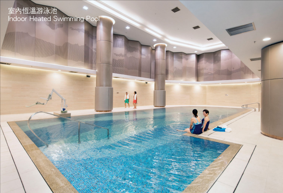
室內恆溫游泳池 Indoor Heated Swimming Pool