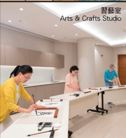
習藝室 Arts & Crafts Studio