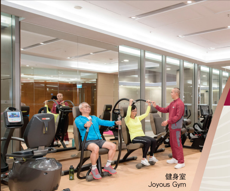
健身室 Joyous Gym