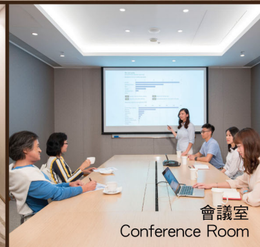
會議室 Conference Room