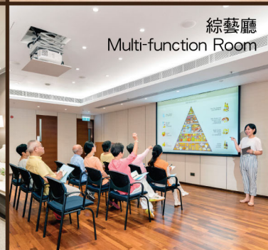
綜藝廳 Multi-function Room