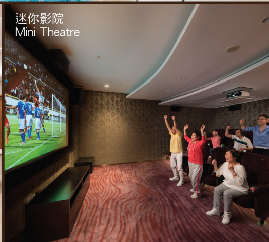
迷你影院 Mini Theatre